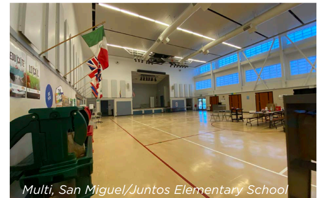
Multi, San Miguel/Juntos Elementary School