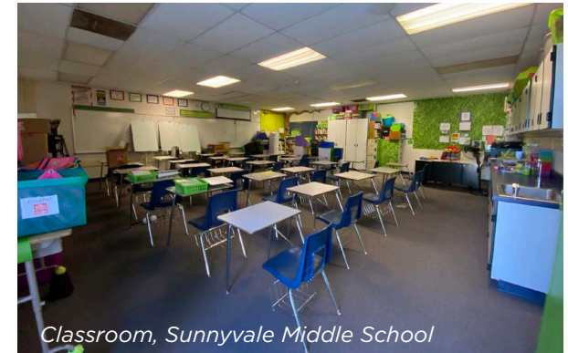
Classroom, Sunnyvale Middle School