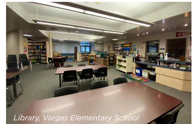
Library, Vargas Elementary School